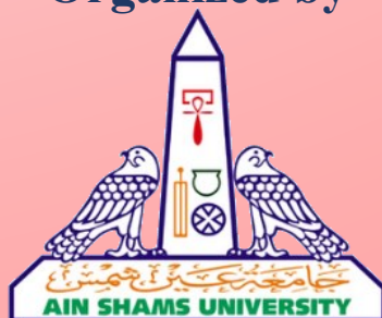
Ain Shams U.