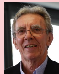
JP Sauvage Nobel Laureate